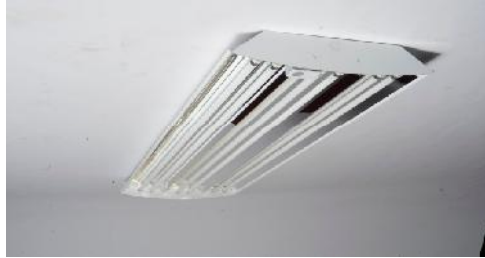
6 Light T5 with Integral Occupancy Sensor and Mirrored Reflector