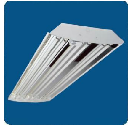
Shown is SS Option with Integral Occupancy Sensor