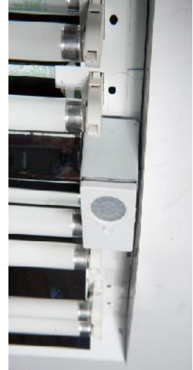
Close-up of Integral Occupancy Sensor in 6 Light Only