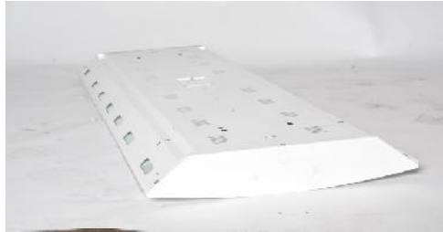
Back of Fixture